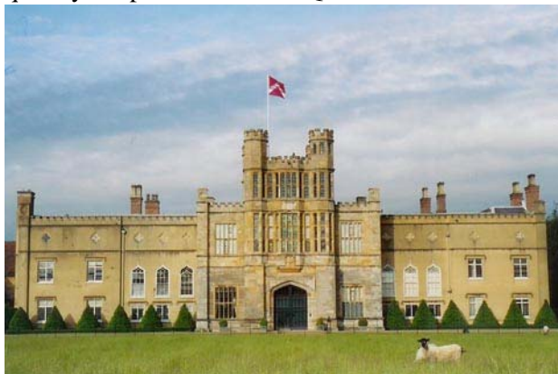
Coughton Court in Warwickshire, England

Elizabeth "Bess" Throckmorton, born about 1575, was named for Queen Elizabeth I, who was her godmother. When Bess was still very young, she was made the Queen's maid-of-honor, and at court she fell in love with Sir Walter Raleigh, the Queen's favorite escort. In 1591 they were married secretly when Bess became pregnant, but secrets were quickly exposed in the Queen's court. Walter