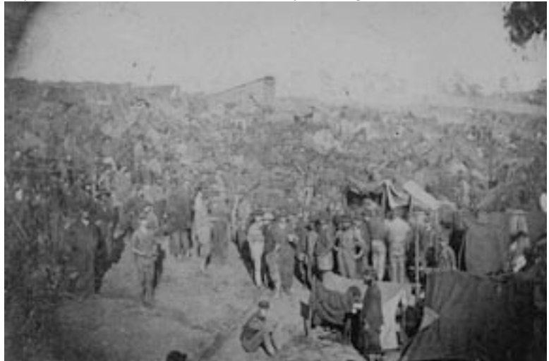
A.J. Riddle took this photograph on August 16, 1864, the day Royal died of starvation.

Andersonville, or Camp Sumter as it was officially known, was a large military prison established during the Civil War. It was built in 1864, with the first prisoners arriving in February. Approximately 400 more arrived each day during the next few months