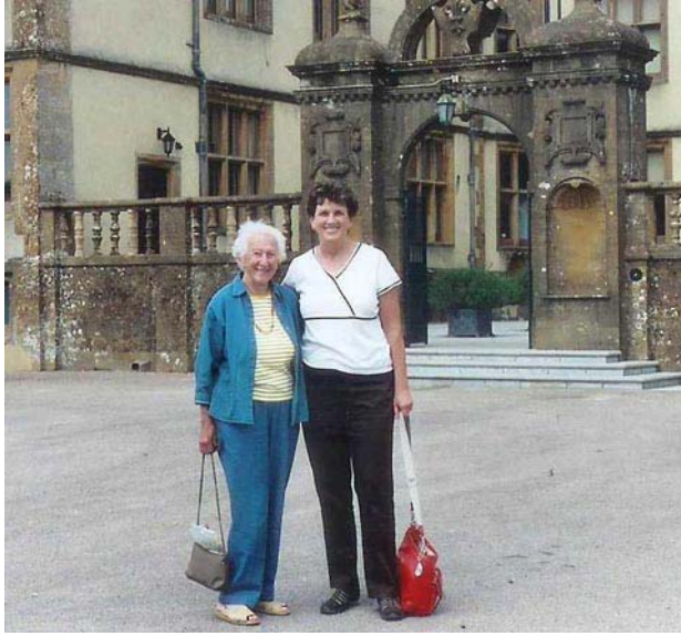
Mother and I at Sherborne Castle, the estate of Sir Walter Raleigh and his wife, Bess Throckmorton