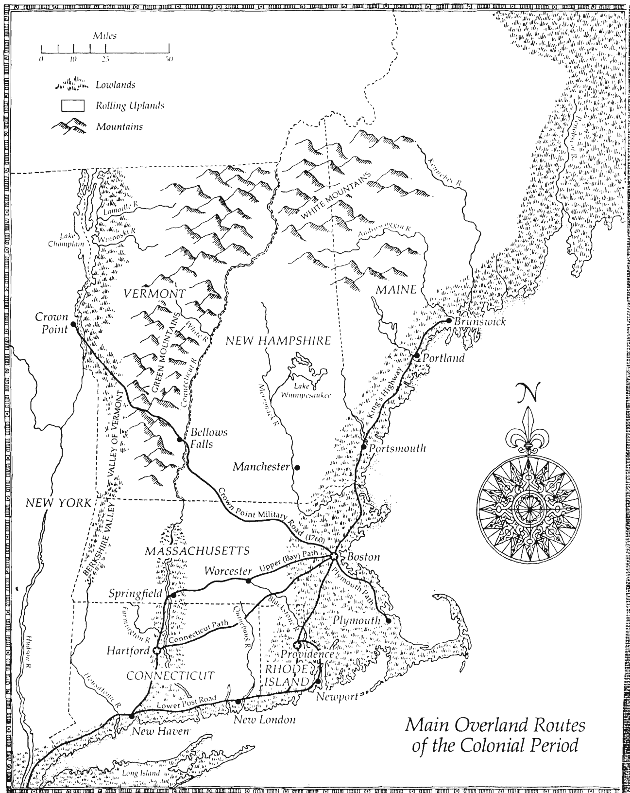
Main Overland Routes of the Colonial Period